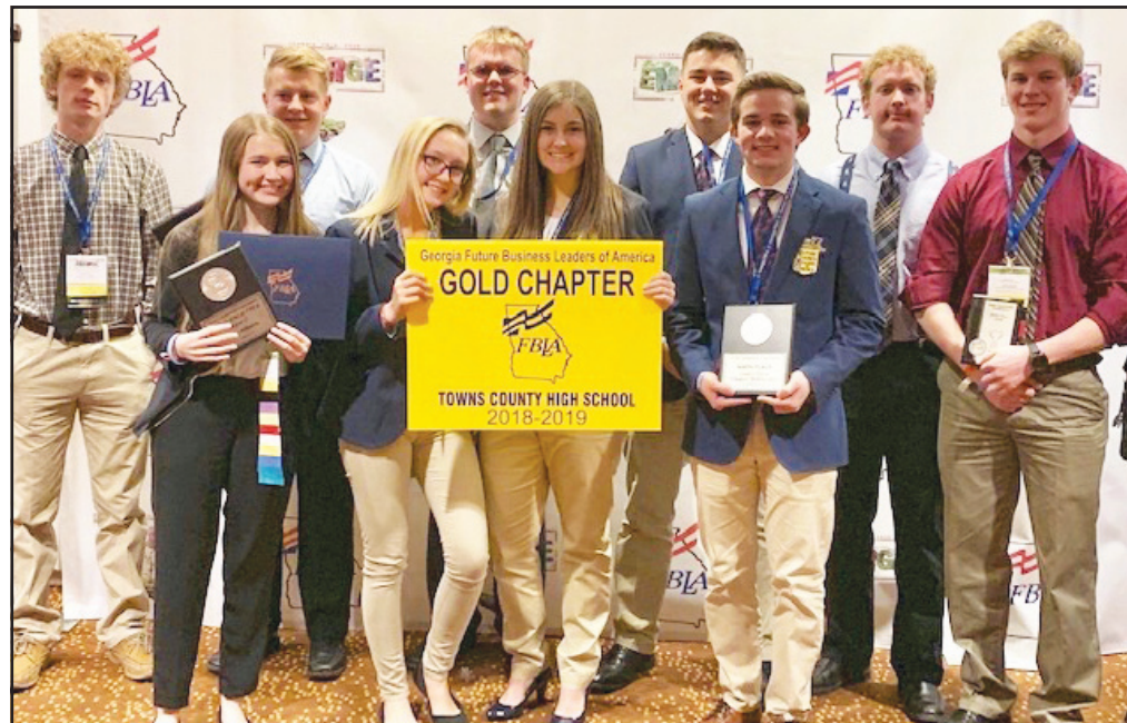
Towns County FBLA students after the awards ceremony at the 2019 State Leadership Conference in Atlanta.